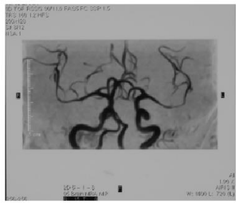
The 19th shooting September 19, 2007

Electron reduction of blood flow improvement after treatment (7 months), arterial brain