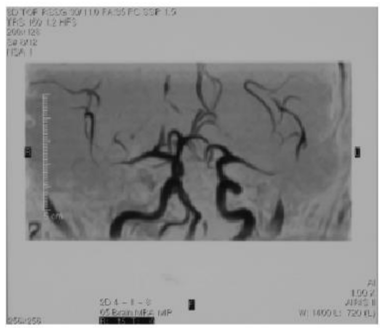
The 26th shooting February 19, 2007